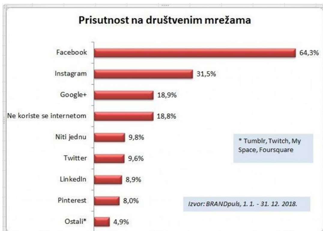
Figure 3: The presence of social networks in Croatia;

As can be seen from Figure 3, in Croatia, according to the research conducted in 2019, the most used social networks were FB, IG and Google+. Facebook is still convincingly the most present social network in Croatia. According to the BRANDpuls research, 64 percent of respondents use this social network, which is more than twice as many as the first follower of Instagram (31%), and in third place with the presence or absence of 28.6% is - 'nobody'. Namely, almost 19 percent of respondents do not use the Internet, and another 9.8% of Internet users are not on social networks. Twitter (10%), LinkedIn (9%) and Pinterest (8%) are more significantly present. Other social networks - Tumblr, Twitch, MySpace and Foursquare - together have less than five percent presence.